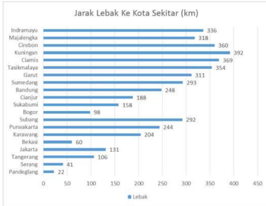
Figure 3. Distance from Lebak Regency to Surrounding Cities (Km)

By sector, Lebak's position is very strategic as an investment destination. This can be seen from the distance of Lebak Regency which is still affordable to a number of big cities in Indonesia. The following diagram shows the approximate distance from Rangkasbitung City to several cities.