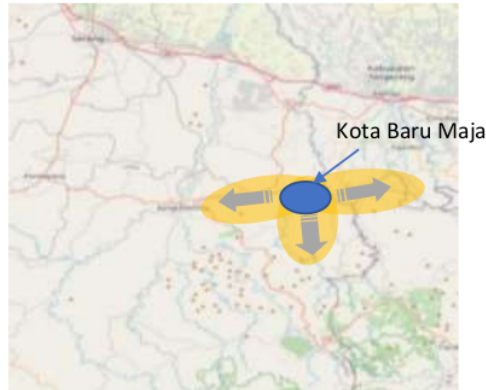
Figure 1. New Maja City Development

buffers in the western part of Metropolitan Jakarta. The position of Kota Baru Maja in the context of a wider area is quite strategic because it is located in 2 provinces whose territory includes 3 regencies, namely; Banten Province (Lebak Regency and Tangerang Regency) and West Java Province (Bogor Regency).