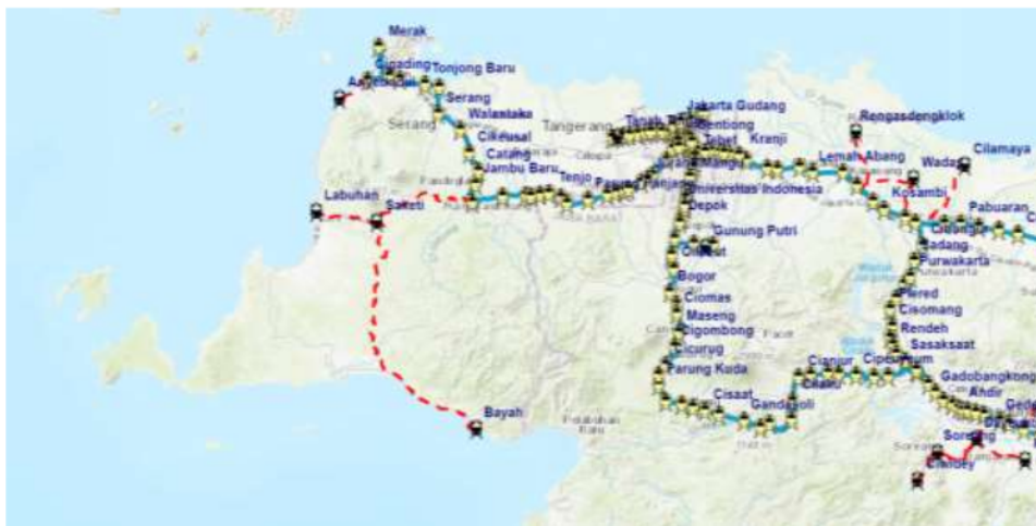
Figure 2. Map of the Reactivation Plan for the Rangkasbitung - Labuan and Saketi - Bayah Railway

In addition, there is a list of projects that are still under consideration but still considered strategic, namely the reactivation of the Rangkasbitung-Labuan and Saketi-Malimping-Bayah trains. Rangkasbitung-Labuan which is a non-active national railway line along 56.6 Km. This cross was built in 1908 and closed since 1984 because it could not compete with other modes of mass transportation. Meanwhile, the 89 km Saketi-Bayah line has 20 bridges, each end with a stone structure. From Malimping to Bayah, the path crosses the shores of the Indian Ocean with the pounding waves are quite large. There are three major stations on this line, namely Saketi, Malimping, and Bayah. Beyond that, there are 10 small stations or bus stops, namely in Cimanggu, Kaduhauk, Jasulang, Pasung, Kerta, Gintung, Cistepan, Sukahujan, Cihara, Panyawungan, Mount Mandur.