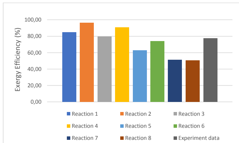
Figure 3. Exergy efficiency of syngas product at 723 K