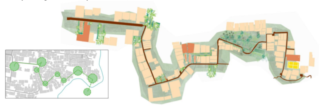
Fig. 2. Sites for public space in Kampung Sruni, Wonosobo make a linear network of green spaces.

public spaces are meant to be integrated into the net of existing public spaces, with a variable gradient of privacy for each one, that is the biggest ones and closest to public facility will be frequented for inhabitants and tourists, and the most hidden ones are meant to host sole inhabitant's need of gathering point.