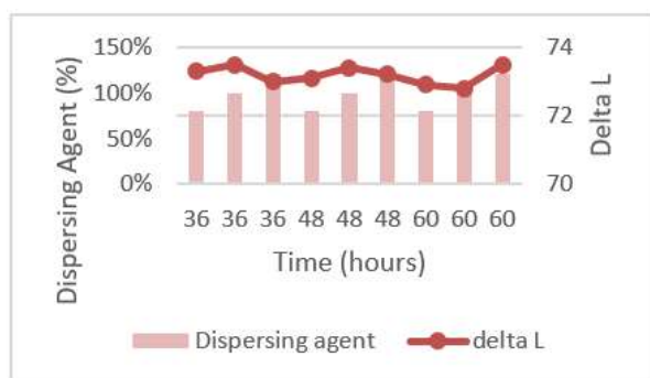
Figure 5. effect of milling time with different percentage of dispersing agent on color.

a useful way of displaying colors in a color space. Color can be determined using the coordinates a^* and b^* , where the positive value of a^* indicates the red color, and the negative value of a^* indicates green color. While b^* represents the yellow/blue difference, with a positive value of b^* indicating a yellow and negative value of b^* indicating blue. Figure 4 shows that the composition of the dispersing agent is not very influential on the value of ( L^* a^* b^* ). However, in the milling time variation, the longer the milling process, the darker the resulting paint color. It is indicated by 60 hours of milling time obtained a value of " L^* is a little smaller than the milling time of 36 hours and 48 hours, although the difference is not too significant. For the a^* value obtained from this study, the results are negative (-4.7), and the b^* value is positive (4.07). This result shows that the carbon black pigment fw-200 beads have the resulting color properties of black with a yellowish-green tone. The mechanical power transferred to the ball mill is related to stirring, which affects the particle size distribution, which will influence the color produced [25,27].