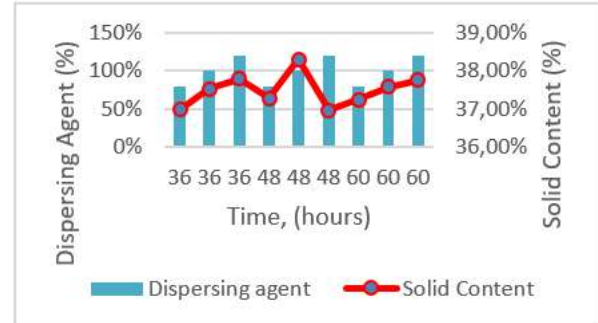
Figure 3. Effect of milling time with different percentage of dispersing agent on solid content.

percentage of dispersing agent, the higher the solid content. For all variations obtained, solid content values still meet the desired standard of 34-38% by weight of the pigment, except for 48 hours of milling time with dispersing agent 100% the solid content was 38.30%.