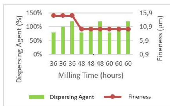
Figure 1. The effect of milling time with different percentage of dispersing agent on fineness.

Figure 1 shows the effect of milling time (36; 48; and 60 hours) with different percentages of dispersing agents (80; 100 and 120%) on fineness. Therefore, 9 results of paint fineness were available.