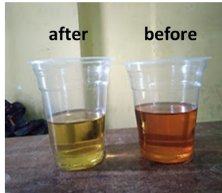
Figure 3. Changes in the color of the oil after being given a durian peel adsorbent

that, under optimal circumstances, the adsorbent can fulfill SNI 3741-2013 standards for cooking oil quality and may be used to purify used cooking oil.